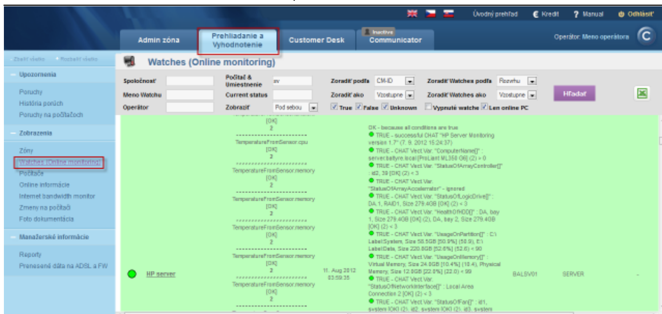
Image: Zobrazenie watchu pre monitoring stavu serverov na CM portáli